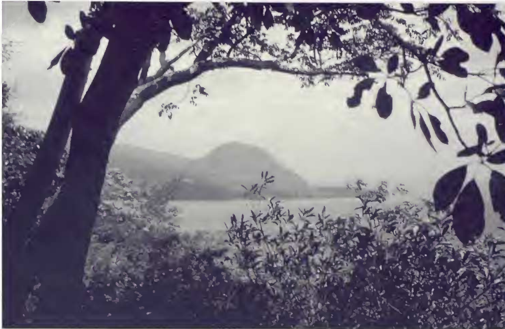
Figure 5.—A view looking south from the Cabrits Peninsula towards Portsmouth, St. John Parish, Dominica.

and overgrazed cattle pastures along both sides of the creek. Well before dark, Baker and Jones observed a swarm of small bats flying across the pasture. There was considerable organization to the group and it almost appeared like flocking behavior. Clearly the group remained closely knit and organized in a ball shape. The group came across the pasture then moved down the creek on one side of the tree line. When they reached the nets several were caught, which called vocally resulting in others becoming entangled. The swarm then moved off and out of sight but retained its swarming organization. Baker estimated the size of the group, which contained both males and females, as several hundred individuals.